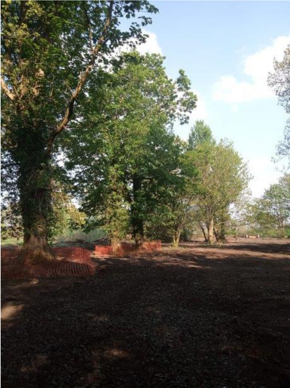
G1 and G2 (sycamores) as viewed from Pale Lane (April 2020)